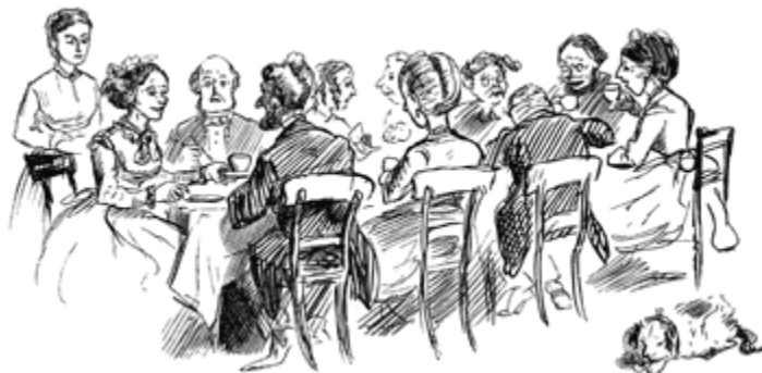
They are sitting around the table.